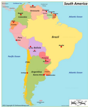
A map of South America

Understand how different biomes give rise to distinctive communities of plants and animals.