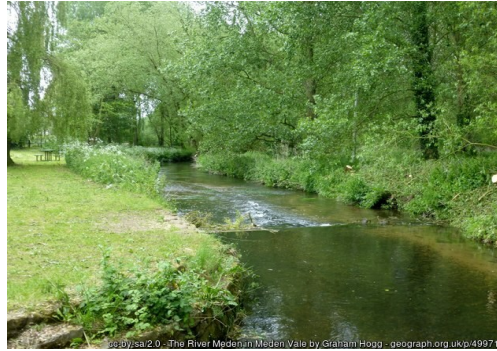
The River Meden at Meden Vale