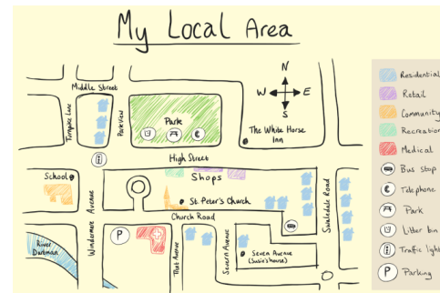
A sketch map