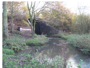
The River Meden - a physical feature