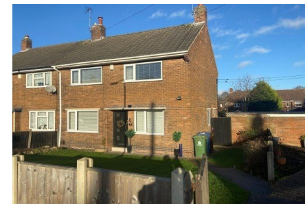
Housing - a human feature