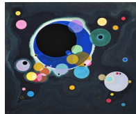
Kandinsky Several circles

Know what a tint is and be able to make tints of colour by adding white.